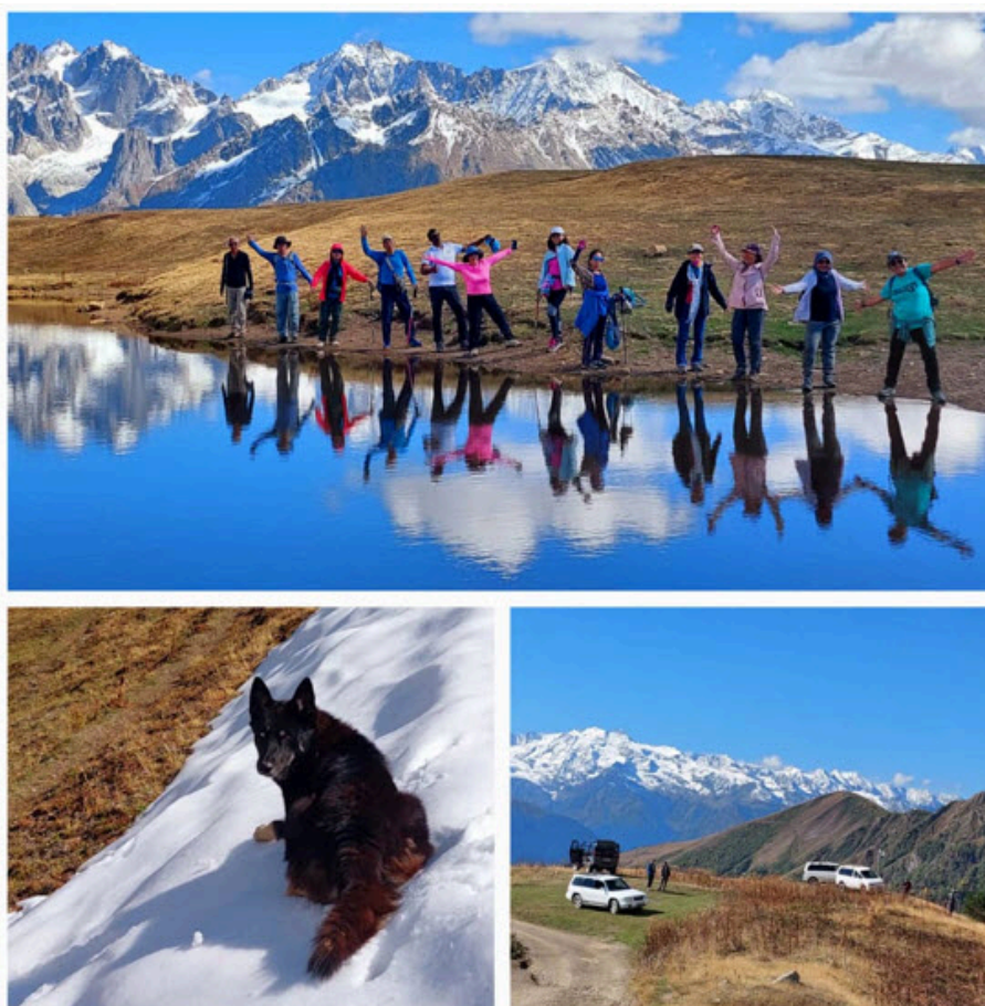
Lake Koruldi Mestia

Day 8 Tbilisi-Kutaisi. After breakfast, drive 23.5KM to the Georgian old capital of Mtshekta. We visit the 6th century Jvari Monastery, a church that has remained almost unchanged, and the 11th century Svetitskhoveli Cathedral, a UNESCO World Heritage site. PM : Continue our journey another 147km to Kutaisi, Georgia's second largest and most central city, We should arrive early evening in time to catch splendid sunset from Gelati Monastery on a hilltop overlooking Kutaisi. ON Kutaisi (B).