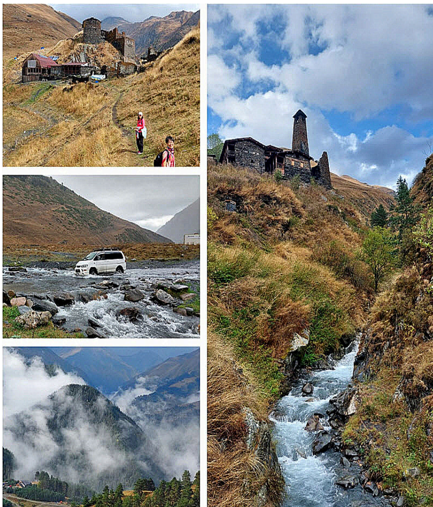
Tusheti National Park - opens only 5 months in a year.

IMPORTANT NOTICE: This is meant to be a "free and easy" adventure trip. Participants should be relatively fit, with a good sense of humor, and above all, have the right attitude for close travel with others through possibly some trying times. Most definitely, this is not a trip for prudes, whiners, fuss-pots, and other similarly assorted types! We had a couple of those before and it wasn't pleasant for us or them. Although every effort will be made to stick to the given itinerary, ground conditions may change and cause some disruption and/or deviation from the norm. Otherwise, have fun.