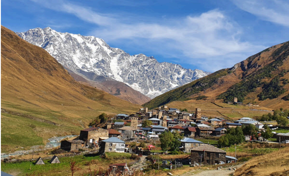
UNESCO list Ushguli Village in Mestia